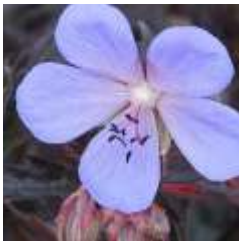
Geranium pratense 'Black Beauty'