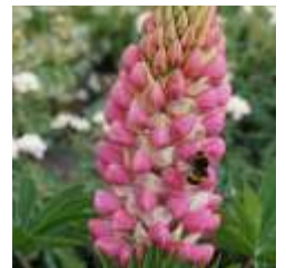
Lupinus 'Rachel de Thame'