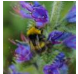
Echium vulgare (biennial)