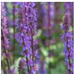
Stachys monieri 'Hummelo'