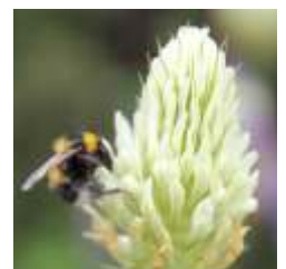
Verbascum chaixii 'Album'