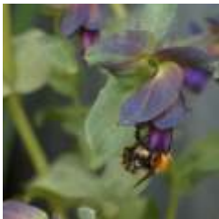
Cerithe major 'Purpurascens' (annual)